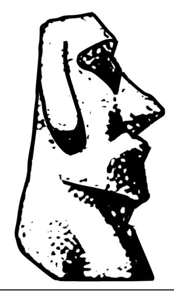
Figure 2. Moai, monumental statues in Chilean Easter Island. RA<sup>©</sup>

*Correspondence to: Reza Afshari; MD, PhD, MPH. Environmental Health Services, BC Centre for Disease Control, 655 West 12th Avenue, Vancouver, BC, V57 4R4