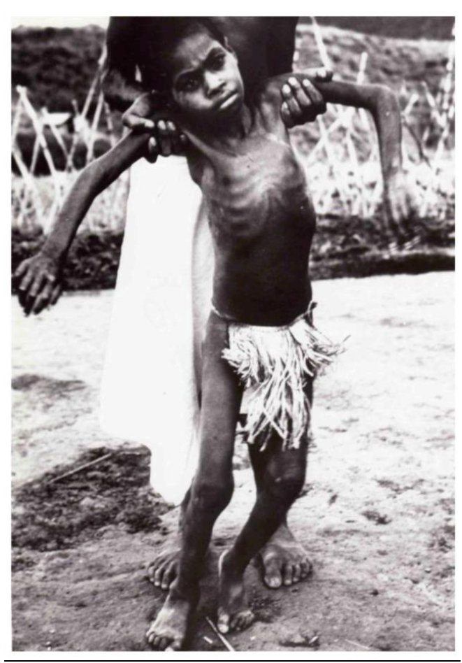
Figure 3. A child with advanced kuru who could neither stand nor sit without support. Courtesy of Dr. Liberski PP, Poland from late D. Carleton Gajdusek (22).

of resources including deforestation. At that led to an epidemic of debilitating and fatal kuru similar to what happened in Papua New Guinea in the early 20<sup>th</sup> century. There is a long time gap between exposure (eating foods during certain feasts) to occurrence of symptoms that would have prevented finding the cause and effect associations. The mentality of 16<sup>th</sup> century remote Easter Islanders would have blamed the disease on failing Moais and other supernatural causes anyway. Transmissible toxic prion exposure would have accelerated their decline. --- All the justifying pieces of evidence are there!