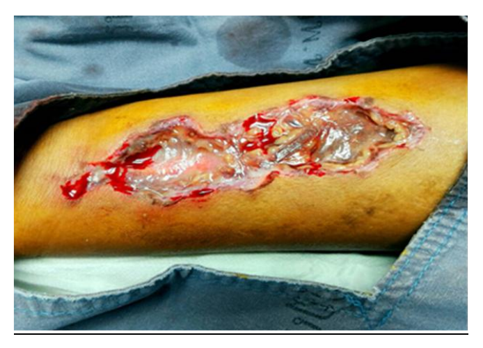
Figure 2. After debridement

metabolism when metabolized, producing Carbon monoxide (CO) via cytochrome P-450 2E1 and glutathione-S-transferase (1) (Figure 3). From an animal model, hepatic conversion of dichloromethane into CO was a saturable metabolic rate. (2)