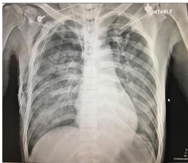
Figure 1. Bilateral patchy infiltration on chest radiography

On the basis of the patient's history, the clinical manifestations and the laboratory investigations, our diagnosis was rhabdomyolysis due to venomous wasp stings. An IV saline infusion was initiated and continued to keep the urine output at over 1 ml/kg/hr. Over the following 8 hours, having received 1150 ml of IV infusion, the patient produced only 325 ml of urine. The patient developed tachypnea with a respiratory rate of 32/min and with intercostal and subcostal retractions. Pulse oximetry revealed an oxygen saturation of 85% while breathing an oxygen concentration of 60%. His heart rate was 120/min, blood pressure was 140/90 mmHg, and heart sounds and JVP were normal. A central nervous system examination was normal except for irritability. A chest radiograph showed bilateral diffuse lung infiltrates (Figure 1).