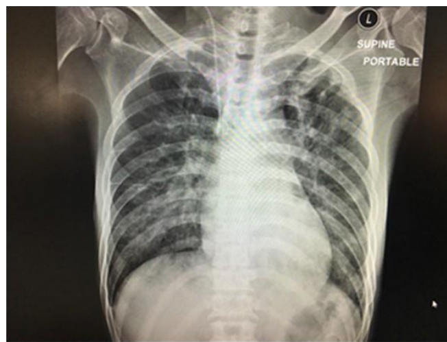
Figure 2. Nearly normal chest radiography after treatment

From the fourth day after ICU admission, the clinical and biochemical pictures started to improve. Arterial blood gas taken while breathing a weaning oxygen concentration of 40% showed a pH of 7.48, pO 2 of 136 mmHg, pCO 2 of 33 mmHg, and an O 2 saturation of 98%. The chest radiography improved to nearly normal (Figure 2). The urine output gradually increased, with its color becoming lighter red and eventually clear and straw; both SCr and CPK also decreased slowly to normal (Figure 3).