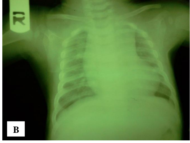
Figure 1. Chest X-ray of the patient: A) on admission showing moderate cardiomegaly, B) one month post-discharge showing normal heart size