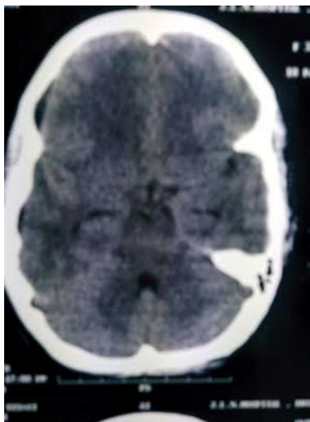
Figure 2. CT scan head shows diffuse cerebral edema